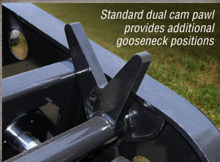
Standard dual cam pawl provides additional gooseneck positions