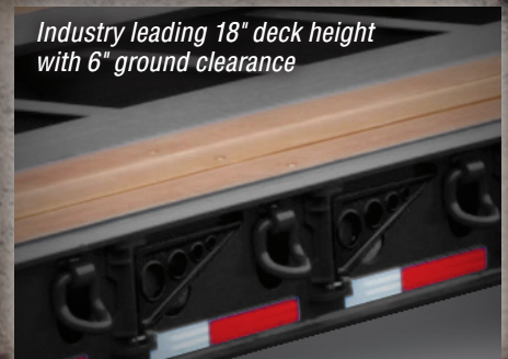
Industry leading 18" deck height with 6" ground clearance